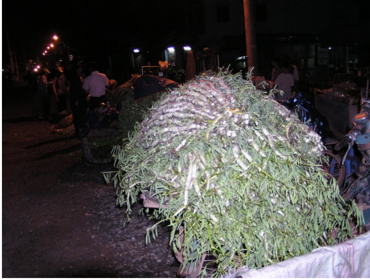
Figure 25: Water mimosa transported by motorbike at Thu Duc district wholesale market, 03:00 hours.