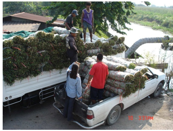
Figure 28: Collection point and transport of morning glory to wholesale markets, Sainoi district, Nonthaburi province, peri-urban Bangkok.