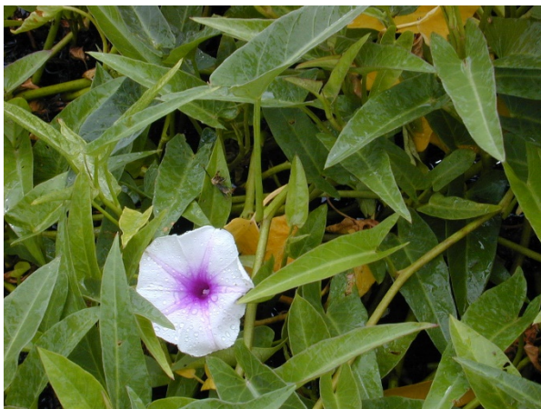
Figure 3: Water morning glory, or water spinach ( Ipomoea aquatica ).

Submersed species have their vegetative growth tissues mainly below the water surface and are normally also rooted into the soil substrate at no more than 1.25 metre water depth. Commercially important examples of these include water morning glory ( Ipomoea aquatica ), sometimes also known as water spinach, and water mimosa ( Neptunia oleracea ), see Figures 3 and 4, respectively. Both species are commercially grown by thousands of producers and households and consumed by millions of people across Southeast Asia.