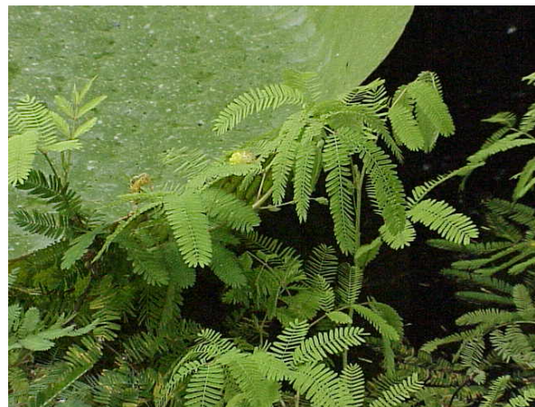
Figure 4: Water mimosa ( Neptunia oleracea ).