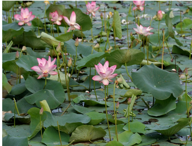
Figure 9: Lotus flower ( Nelumbo nucifera ).

The perennial water chestnut ( Eleocharis dulcis ) (Figure 8), belonging to the family Cyperaceae, has been cultivated for hundreds of years throughout southern areas of China (Herklots, 1972), often in polyculture with paddy rice, and seasonally rotated with other crops such as lotus and arrowhead. Likewise, since the 1950s, it has been translocated for trials in Australia, Indonesia (Java) and the Philippines where it is considered to have potential as a higher value crop. It is cultivated for its tasty underground cormels, which can be used as a vegetable or a fruit, fresh or canned, or processed to extract the starch within. The earliest documented record of water chestnut is found in the book Erya (or Erh-ya ) around the second century BCE (Kong, 2005). Currently, it is spread widely over the whole of China except in the colder regions. The leading production areas are the Yangtze Valley and the south-east coastal regions. The popular cultivars of water chestnut are regionally based, with “Su water chestnut” found and grown in Jiangsu, “Hangzhou Big Red Coat” in Zhejiang, “Xiaogan water chestnut” in Hubei, and “Guilin Mati” in Guangxi provinces.