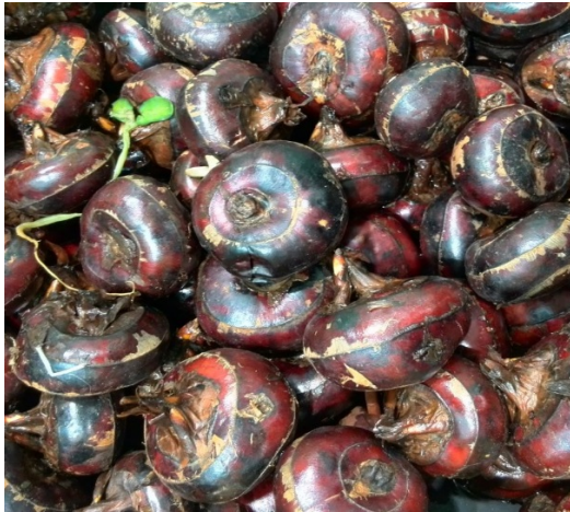
Figure 8: Chinese water chestnut ( Eleocharis dulcis ).