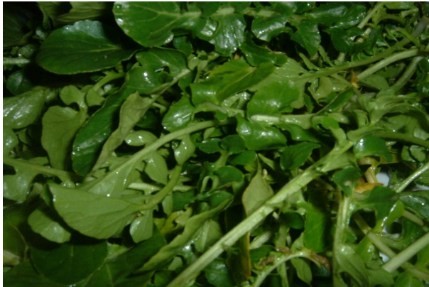
Figure 12: Watercress ( Rorippa nasturtium-aquaticum ).

production to grow water morning glory and water mimosa in the warmer eight months, and then changed over to the slower growing watercress ( Rorippa nasturtium-aquaticum ) (Figure 12) and water dropwort ( Oenanthe javanica ) (Figure 13) in the four cooler winter months to maintain their incomes and cash flows.