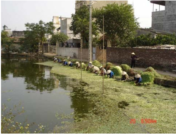
Figure 17: Following harvesting, water morning glory growers in Bang B village prepare and wash bundles in freshwater ready for transporting to market. The removed waste leaves are collected and used in the commune as pig and fish feed.

not a problem, as at least once a fortnight he and his wife harvested either the water morning glory or water mimosa, washed it and cut it into bundles (Figure 17).