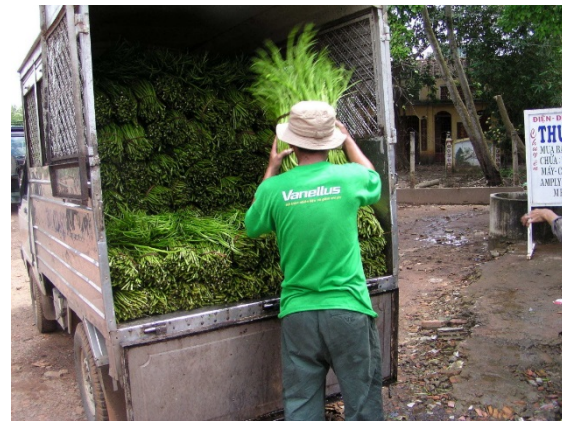
Figure 20: A small truck is a typical mode of transport for aquatic plants in Ho Chi Minh City.