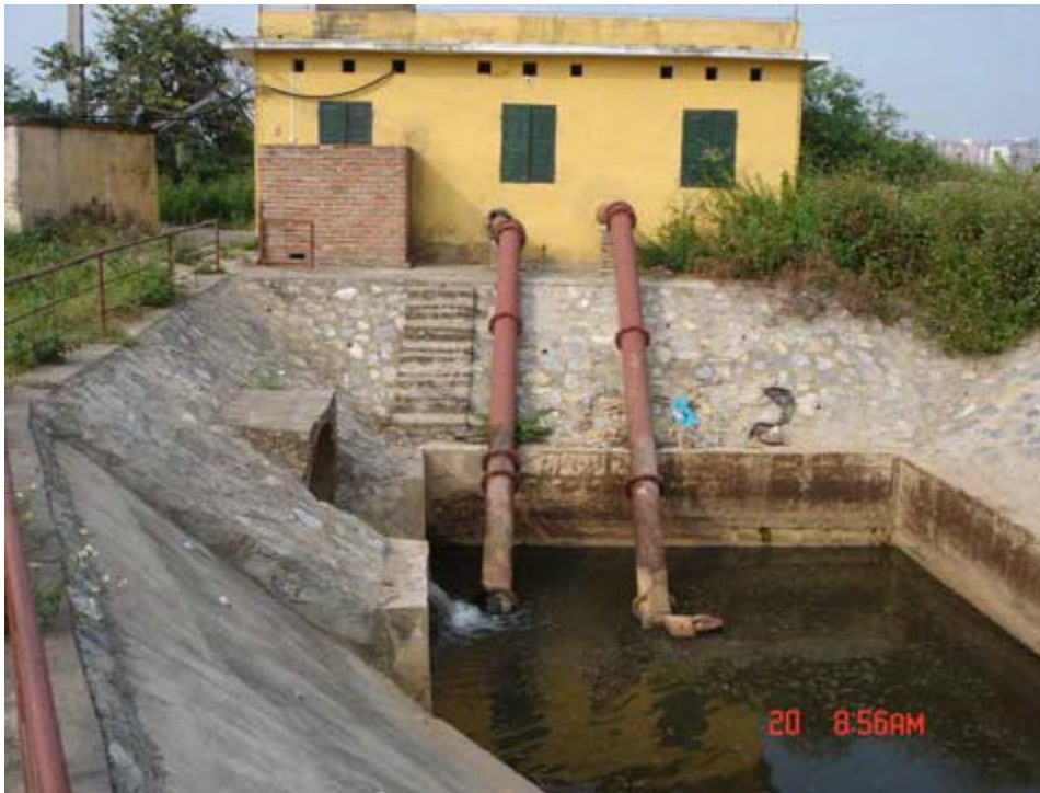
Figure 16: One of the electric-powered wastewater pumping stations for Bang B village at the Tor Lich River.

commune level and aquatic plants were no longer cultivated in the wastewater rivers. Each local commune also had an electric-powered water-pumping station installed next to the Tor Lich River (Figure 16), for which local households paid a regular fee, but small, if they were using the wastewater to irrigate their plots.