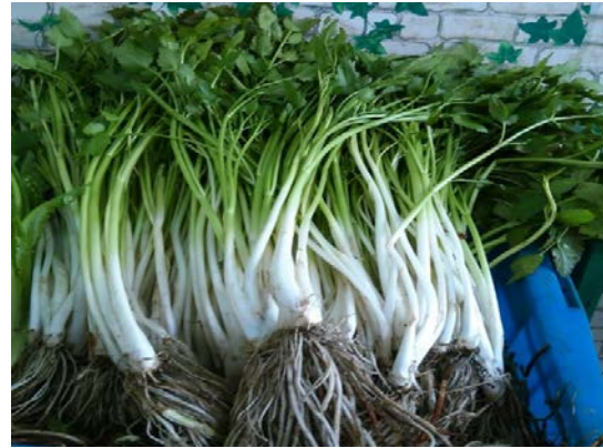
Figure 13: Oenanthe javanica (semi-domesticated cultivar).

Water dropwort is a perennial FAM belonging to the Umbelliferae family, which has a preference for growing in more temperate climates. Just 100 grams of this aquatic plant contains 2.5 grams of protein, 0.6 grams of fat, 4 grams of carbohydrate, 3.8 grams of crude fibre as well as vitamins, carotenoids, nicotinic acid and minerals (Wang, 1991). It is believed to originate from East Asia, with China being one of its original regions. It can be found growing wild in rice fields, streams and wetlands bordering the Yangtze River and areas south of it, with Sichuan and Yunnan provinces being areas where it is found regularly.