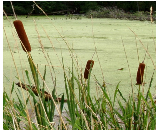
Figure 2: Cattail ( Typha sp.).