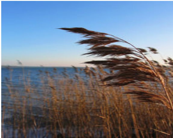
Figure 1: Common reed ( Phragmites australis ).

The common reed Phragmites sp. is used widely as a roofing and housing construction material, thus reinforcing the fact that aquatic macrophytes are also grown and used for purposes other than food production.