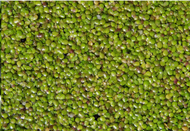
Figure 6: Duckweed ( Lemna sp.).