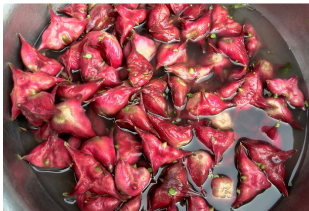
Figure 10: Trapa sp.

for the flowers but also for food from the different parts of the plant. The tubers and seeds are used in a range of cooked and fresh dishes. Its rhizome is nutritious, with 100 grams of fresh underground stem containing 1 gram protein, 19.8 grams of carbohydrates, 19 mg calcium, 51 mg phosphorus, 0.5 mg iron and 25 mg vitamin C (Wang, 1991). These underground rhizomes can be harvested all year-round, allowing them to remain viable after being transported long distances (Zhao, 1999). Lotus is also considered a medicinal plant with the leaves being used to feed fish or castor silkworms, and it is used as a food packaging material.