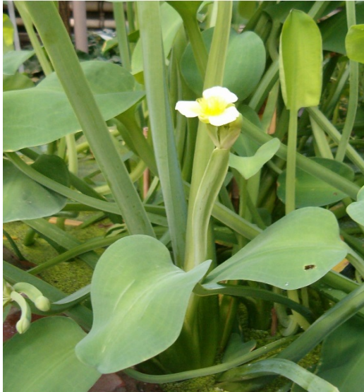
Figure 7: Yellow burrhead ( Limnocharis flava ).