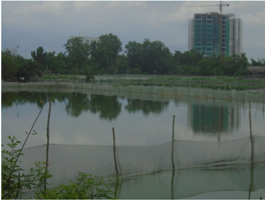
Figure 23: A new ornamental fish farm set up on former aquatic plant cultivated land, Binh Chanh district, Ho Chi Minh City. Residential construction is ongoing in the background.