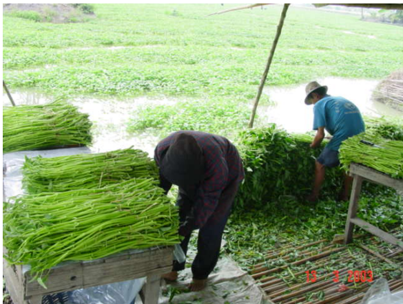
Figure 27: Harvesting water morning glory, Nongpraongai village, Nonthaburi province.

morning glory production increasing from about 20 tonnes per hectare per year (wet weight) to over 70 tonnes per hectare per year by 2004. At this time, he was transporting and selling up to 2 tonnes (wet weight) of morning glory and water mimosa per week in Talat Thai market, which is one of Bangkok’s two large fruit, vegetable and fish wholesale markets (Figures 27 and 28). He estimated that this market received and sold between 80 and 100 tonnes of FAMs daily, mainly water morning glory, water mimosa and lotus, at an approximate value of USD35 000 each day, thus illustrating the size and scale of this food production sector in Thailand. When asked about the future of aquatic plant cultivation in and around Bangkok, he believed growing market demand would ensure people like him could continue to produce it profitably. However, he was concerned about the continuing expansion of the city outwards and the inevitable disappearance of agricultural land to buildings. He also thought the increasing influence of supermarkets, some of which he had contracts to sell both land vegetables and aquatic plants, would through consumer pressure, prefer to see more chemical-free healthier “organic” vegetables. In the last few years, he had started to trial chemical-free land vegetable production, which although having lower yields, could sell for higher premium prices in the big Bangkok supermarkets.