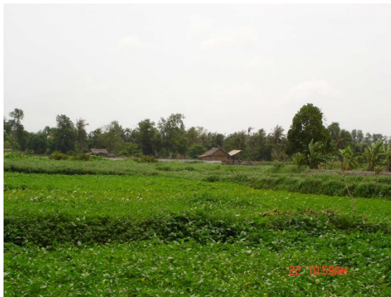
Figure 19: Water morning glory cultivation in wastewater Phong Phu commune, Binh Chanh district, Ho Chi Minh City.