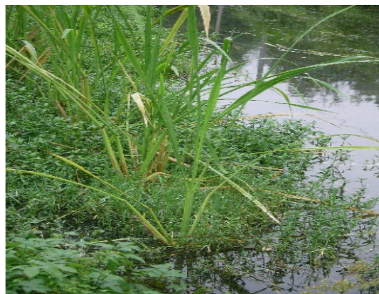
Figure 11: Water bamboo ( Zizania caduciflora ).

Water caltrop, Trapa spp. (Figure 10), is a floating aquatic herbal plant, which is found wild and can be cultivated in lakes and ponds as well as shallow waters such as channels and rice fields. The edible fruit is rich in carbohydrates, proteins, various vitamins and minerals and is eaten both cooked and processed to include in noodles and wine. It belongs to the Trapa genus of the Trapaceae family and contains the compounds ergosterol and sitosterol, which have been recorded as treatments against stomach cancer and cancer of the womb (Li, Teixeira da Silva and Cao, 2007). Although now spread across at least three continents, its main cultivation and consumption is in China, south of the Yangtze River.