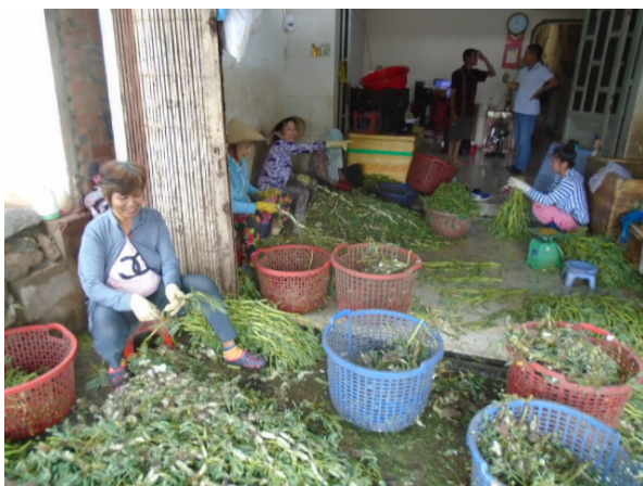
Figure 21: Processing of water mimosa ready for sale at Anh Bay's shop.